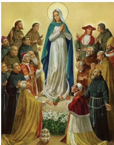
Queen of all Saints